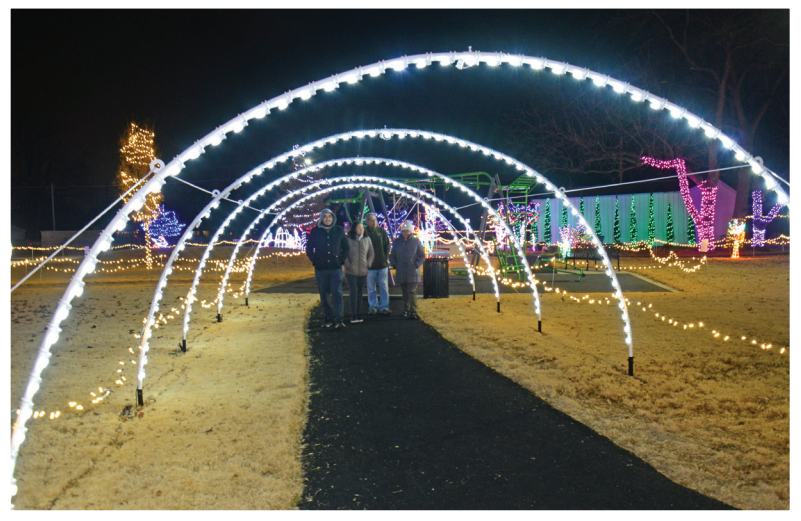
Many families enjoy visiting Olivia's Playground to see the various Christmas light displays and snap holiday portraits. The lighted arches were added to the display last year.